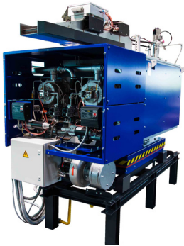
Backview Magnesium dosing furnace MDO250R

In combination with our LPS system with pump compensation a shot accuracy of \pm 0,75\% of the shot weight will be achieved (depending on the operating conditions).