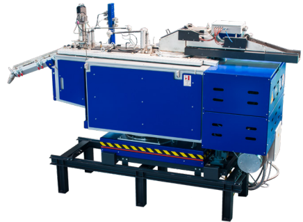
Side view Magnesium dosing furnace MDO250R