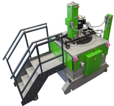
Aluminium low pressure furnace ANO